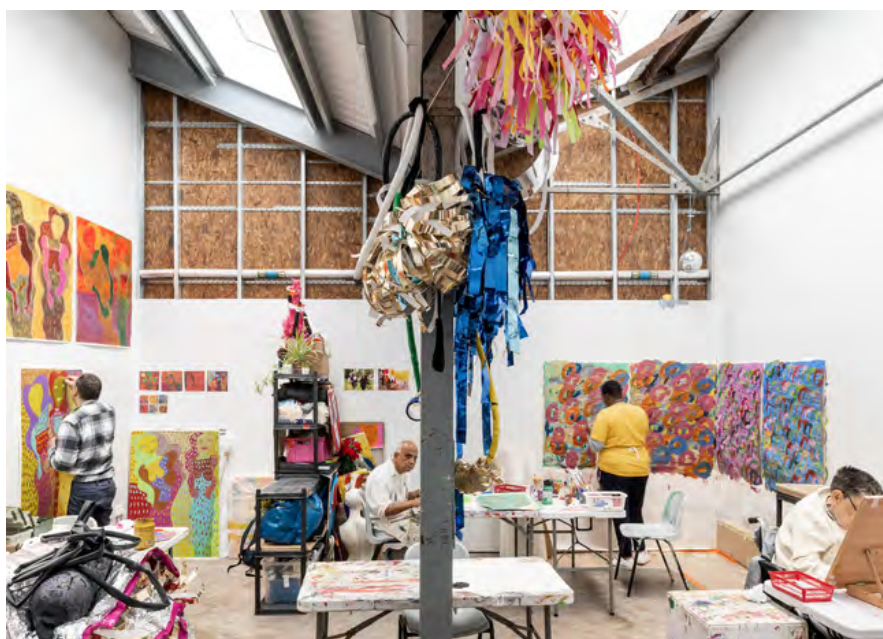
ActionSpace's Studio at Studio Voltaire in Clapham